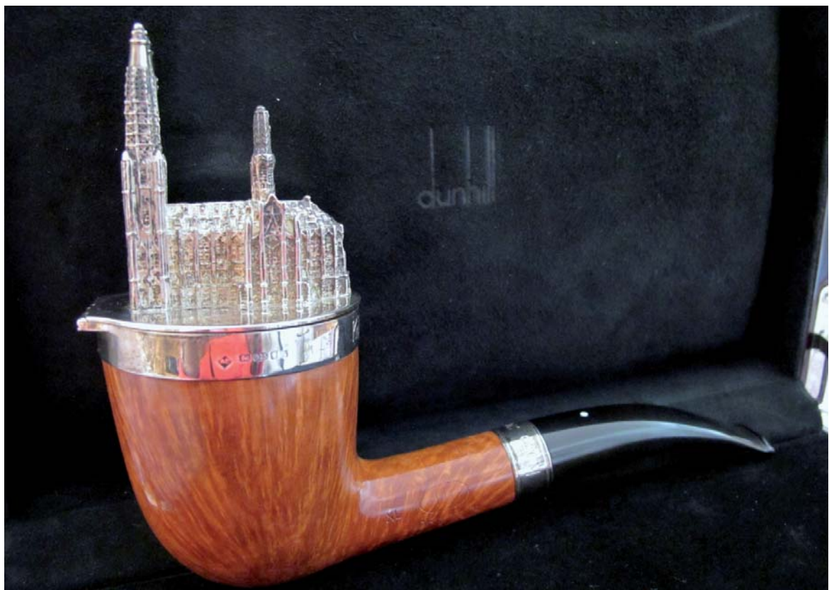
Figure 2: Specially commissioned Dunhill Pipe.

In 2005, in recognition of his contribution to the pipe world, Dunhill produced a special pipe for Peter (Fig. 2). This unique straight grain pipe has a cover made of silver that depicts Cologne cathedral, which holds a special affiliation for Peter. On the rim of the lid you can find Peter's name.