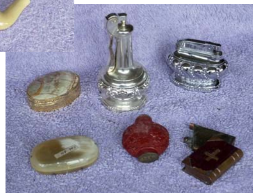
A selection of 'record' photographs of the Jacques Cole Collection (National Pipe Archive Acc. No. LIVNP 2014.03).